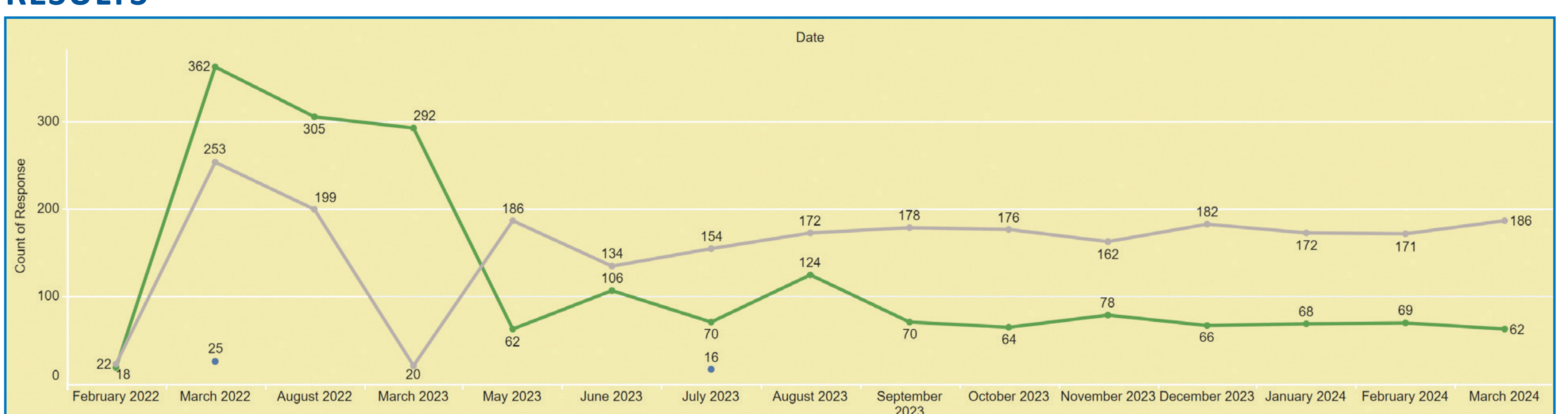
Tableau run chart showing sustained adherence to hand hygiene over time. The green line shows the "yes" responses and the gray line the "Not observed "responses, and blue data points show the "No" responses.